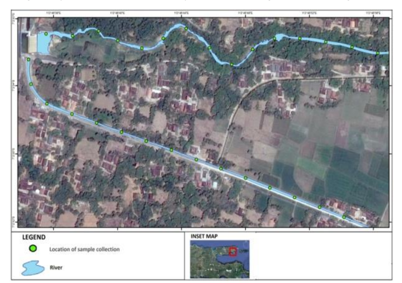
Figure 1. Sample collection location

In Table 2 shows Javaen Barb fish fecundity ranged around 26,933 – 63,041. Then, histogram analysis was conducted to see oocyte diameter distribution based on the diameter class interval as shown in Figure 2. Histogram analysis was conducted to know fecundity value based on the weight class as shown in Figure 3.