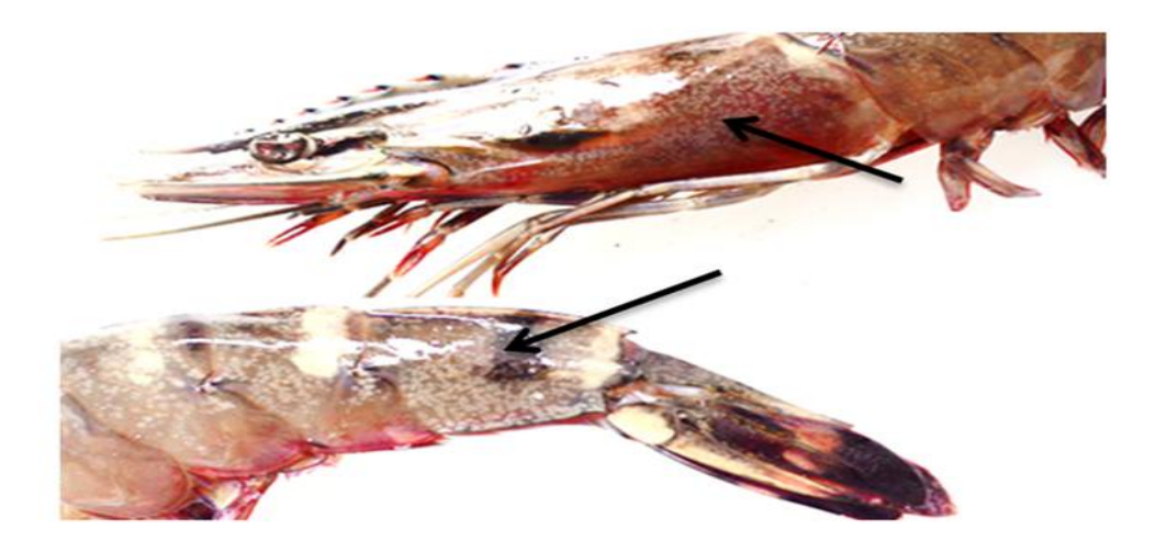
Figure 2. Samples of infected shrimp WSSV (black arrows indicated the patches of white spot signs of WSSV clinical symptoms).

After PCR testing on 50 samples of tiger shrimp taken from some tiger shrimp traditional farming in tarakan region during the period in January - March 2015 obtained four positive samples infected with WSSV which 2 samples have WSSV clinical symptoms such as white spots (Figure 2) and 2 samples without clinical symptoms. Positive samples then calculated and the prevalence of WSSV was obtained by 8%.