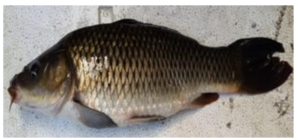
Figure 2. Common Carp (Cyprinus carpio) from Punten Village, Indonesia

The main parameters observed in this research were estradiol- 17\beta concentration [6], and spawning period [3] of the brood fishes. In order to determine the concentration of estradiol- 17\beta during the research, the blood samples of the brood fishes were taken and centrifuged before and after the injection of pituitary gland of the frog. Then the plasma was separated and stored at -20 °C in fridge before examined quantitatively using a coated tube Radio Immuno Assay (RAI) kit (diagnostic product corporation Los Angeles, USA). The research was conducted based on Completely Randomized Design (CRD) method. This method provides maximum degree of freedom for error since all factors are under control of researcher and the analysis of data very simple.