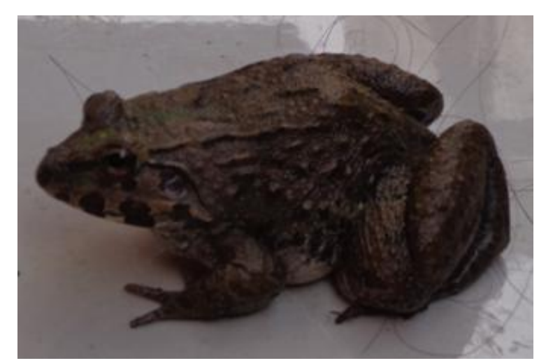
Figure 1. Crab-eater Frog (Fejervarya cancrivora) from Tumpang Village, Indonesia

The brood fishes used in this research were 25 female common carps ( C. carpio ) from Punten village, Batu Malang, weighted 1,000 – 1,800 g, with 32 – 38 cm length, and aged 15 – 18 months old.