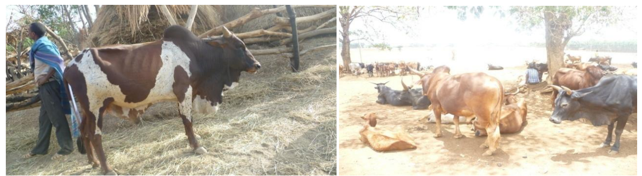
Figure 4. Perpetual sheath and tail length of the bull in Mid land and Low land agro-ecology respectively.

From the total female cattle population evaluated, udder size of 19.8% them were small, 48.9% medium and 31.3% large in Low land, 18.2% small, 57.4% medium and 24.3% large in High land and 20.2% small, 45.7% medium and 34.1% large in Mid land agro-ecology (Figure 5). Similarly navel flap for cows were 22.1% small, 57.3% medium and 20.6% large in Low land, 31.1% small, 48.6% medium and 13.5% large in High land and 18.6% small, 55% medium and 26.4% large in Mid land agro-ecologys. As shown in Table 2, all of qualitative traits were significantly different among districts and this difference might be due to the agro ecological difference of the three districts.