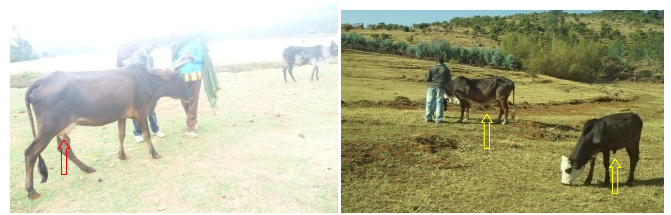
Figure 5. Udder size and naval flap of cow respectively in High land agro-ecology