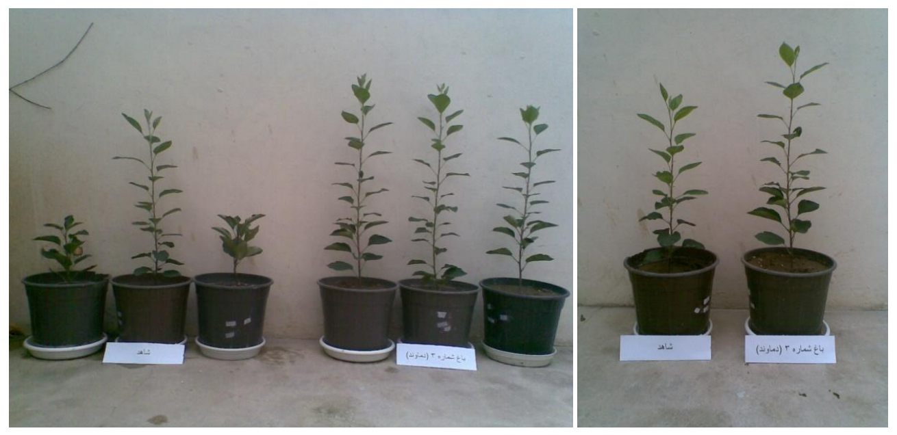
Figure 2. Seedlings length in control and mycorrhizal plants after 4 weeks of Mycorrhiza inoculation

All data from the trial were analyzed by ANOVA using the GLM procedure of SAS software [14], which was appropriate for a randomized complete block design. When significances were detected (P < 0.05), values were compared post-hoc using the Duncan test. The results are expressed as averages and their Standard Error (SE).